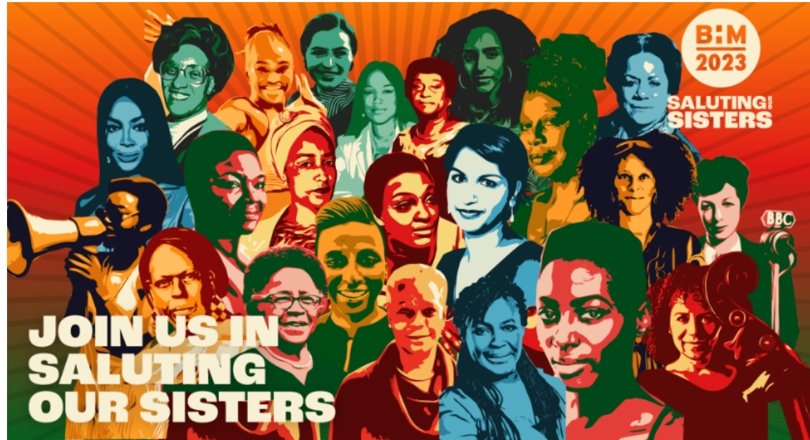
Graphic by Black History Month