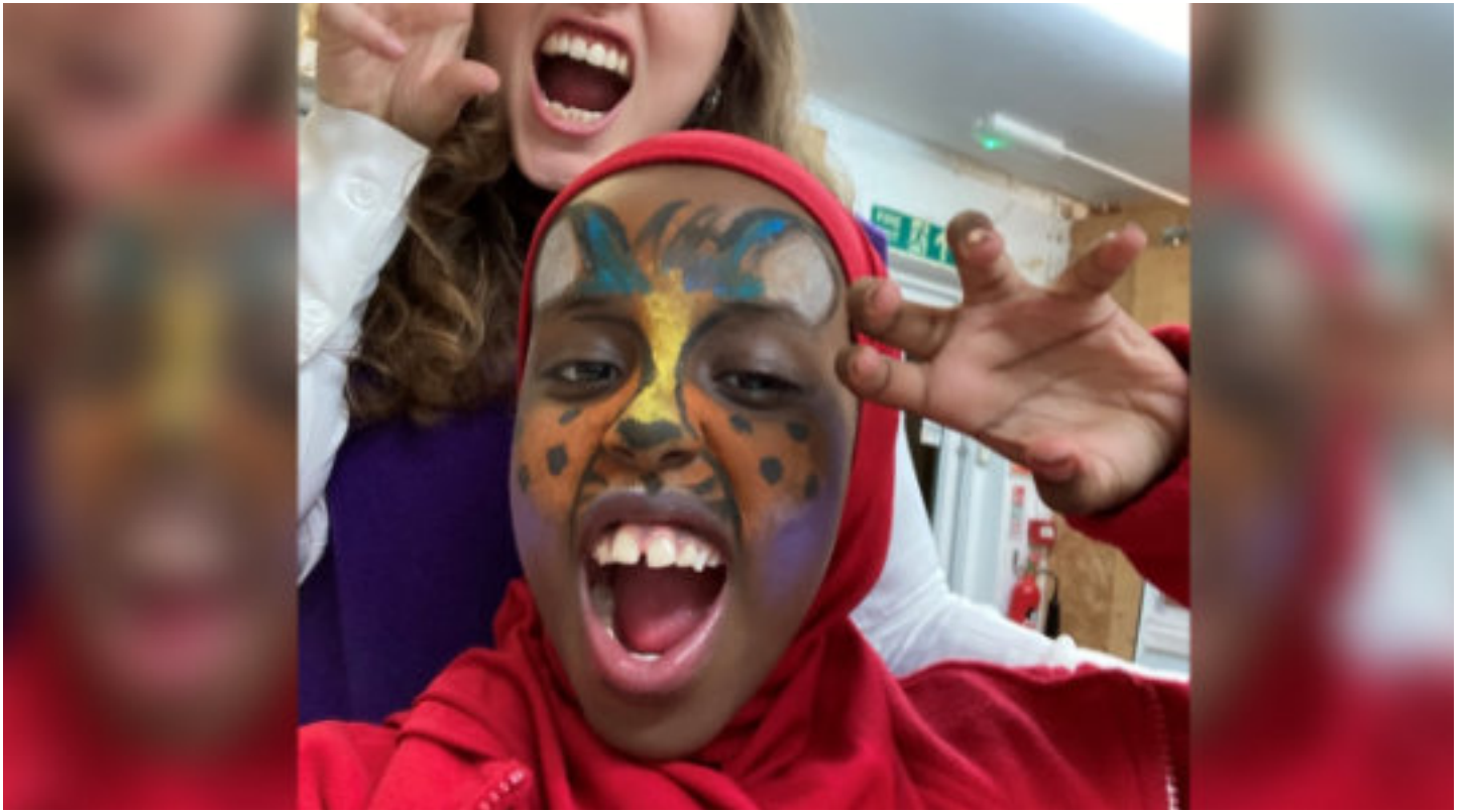
A young resident enjoying the face painting activity at the Waltham Forest residents' event