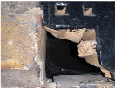
Broken grill above intake cupboard door.