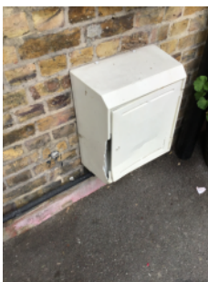
Broken gas meter cabinet.

Gas pipe work in good condition, with gas meters located in external bespoke cabinets, although the cabinet on the ground floor is broken.