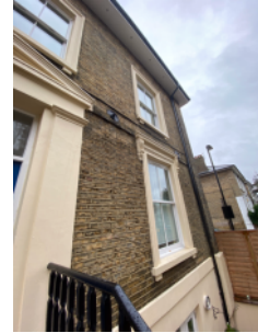
Brick/mortar external walls - front elevation