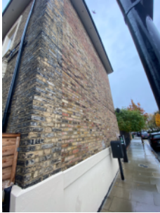
Brick/mortar external walls - side elevation

Masonry construction with solid concrete intermediate floors and stairs, masonry internal walls and a pitched roof. Access to common areas is via a secure entrance controlled by an intercom system providing access to entrance hallway and common stairwell. Flats A and B are accessed externally to the rear of the building at basement level, flats C and D are accessed off the stairwell at first floor level. An intake cupboard is accessed within the common areas at ground floor level.