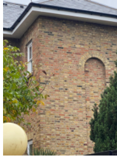
Brick/mortar external walls - rear elevation