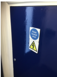
Fire door keep locked signage on the electrical cupboard door