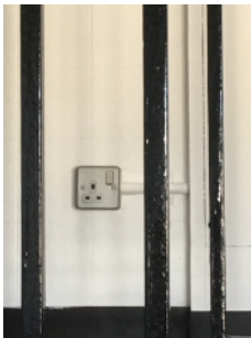
Electrical sockets provided in the common staircase

It is advised to remove electrical air fresheners from the common staircase.