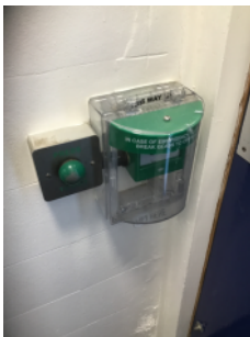
Door release and emergency door release to the main entrance door

Child's scooters and a pram were located on the half landing between ground and first floors.