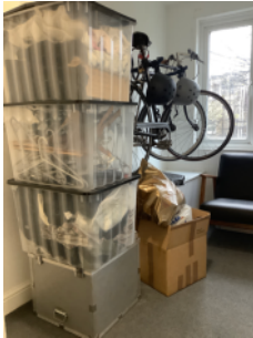
Combustibles and obstructions on the staircase

The first half-landing contains an unacceptable amount of combustibles and items which would cause an obstruction to escaping persons in the event of a fire.