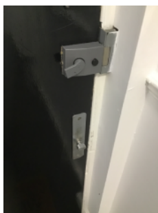
Thumb-turn device fitted in main entrance door

The number of items in the staircase has significantly increased since the last inspection. The first half-landing now contains an unacceptable amount of combustibles and items which would cause an obstruction to escaping persons in the event of a fire.