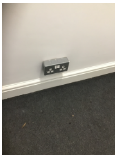
Electrical sockets provided in common staircase

There are electrical sockets in the common areas, presumably for use by cleaning staff. These were in good condition and showed no evidence of misuse by residents or visitors.