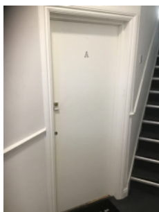
Example of FED in the building

The provision and condition of self closing devices, intumescent strips/cold smoke seals, and effective door closing action of these doors however could not be assessed and this should be confirmed ensure all doors afford FD30S SC standard of fire resistance.