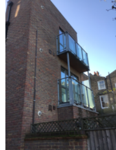
Private balconies- rear elevation