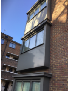
Metallic rainscreen/cladding section around windows at the front elevation

The assessment is likely to take account of information on any approval of the building (and alterations to the building) under the Building Regulations, and of information on external wall construction and any cladding available from the Responsible Person (e.g. in operation and maintenance manuals, or handed over for compliance with Regulation 38 of the Building Regulations); It is unlikely that an RICS EWS1 form will provide adequate assurance on its own.