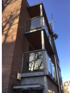
Private balconies - side elevation