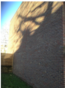
Brick/mortar external walls- side elevation