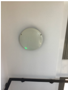
Maintained Emergency Lighting in the staircase

Although this inspection took place during daylight hours, given the provision of street lighting in the immediate vicinity and lighting provided by surrounding buildings, it is reasonable to assume there would be sufficient borrowed light to aid escape in these areas.