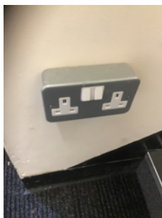
Electrical sockets in staircase

There are electrical sockets in the common areas, presumably for use by cleaning staff. These were in good condition and showed no evidence of misuse by residents or visitors.