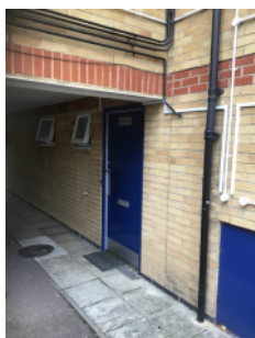
Flat A has direct external access

Attention is drawn to the Ministry of Housing, Communities & Local Government Consolidated Advice Note for building owners of multi-storey, multi-occupied residential buildings, dated January 2020. The Advice Note recommends that building owners should consider the risk of external fire spread as part of the fire risk assessment for multi-occupied residential buildings. Consideration has been given to this matter within this fire risk assessment. The Advice Note further recommends the assessment of the fire risks of any external wall system, irrespective of the height of the building.