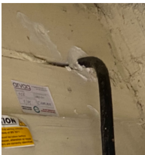
Fire stopping within electrical cupboard.

There is a Georgian wired fanlight above FED to flat D, which appeared to be in good condition with no visible damage or defect.