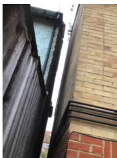
Brick/mortar external walls - side elevation