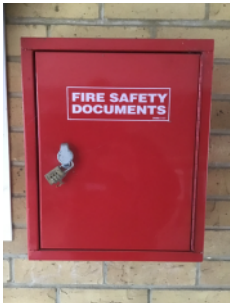
Fire documents box provided - contents unknown