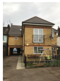
Brick/mortar external walls - rear elevation