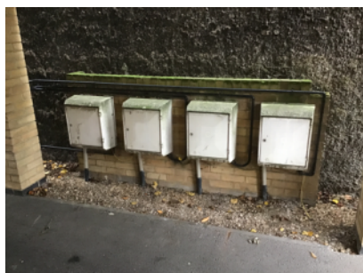
Gas meters are located externally