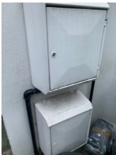
Gas meters located externally

Gas meters are located externally and not in common areas.