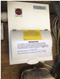
Evidence of testing of fixed electrical installations in external cupboard

No fixed electrical installations present in the common parts.