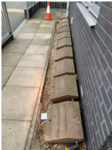
Gas cabinets at front of building

Gas meters are located externally in bespoke cabinets.