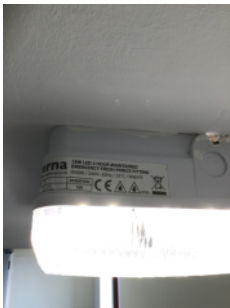
Maintained emergency light units provided in the staircase

Comments Although this inspection took place during daylight hours, given the provision of street lighting in the immediate vicinity and lighting provided by surrounding buildings, it is reasonable to assume there would be sufficient borrowed light to aid escape in these areas.