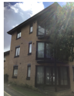
Brick external walls - front of building