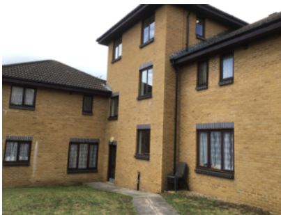
Brick external walls to the rear of the building

Attention is drawn to the Ministry of Housing, Communities & Local Government Consolidated Advice Note for building owners of multi-storey, multi-occupied residential buildings, dated January 2020. The Advice Note recommends that building owners should consider the risk of external fire spread as part of the fire risk assessment for multi-occupied residential buildings. Consideration has been given to this matter within this fire risk assessment. The Advice Note further recommends the assessment of the fire risks of any external wall system, irrespective of the height of the building.