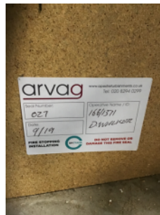
Fire stopping certification label in meter cupboards