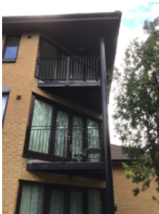
Steel balconies with steel decks