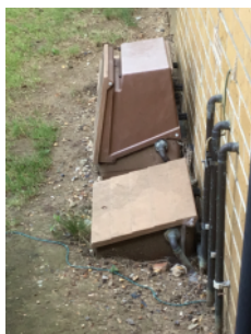
Gas meters located externally

Gas meters are located externally and not in common areas.