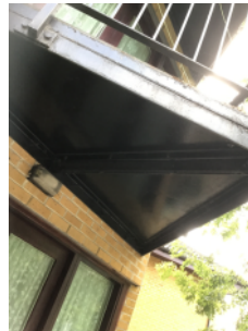
Steel deck of balconies