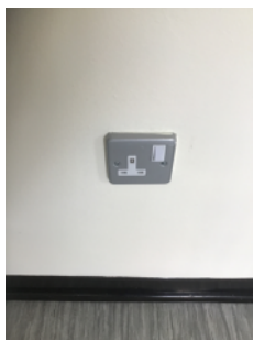
Electrical sockets provided in common staircase

There are electrical sockets in the common areas, presumably for use by cleaning staff. These were in good condition and showed no evidence of misuse by residents or visitors.