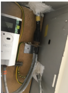
Fire stopping within meter cupboards

There are Georgian wired glazed side panels to lobby doors.