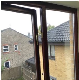
Openable windows in staircase