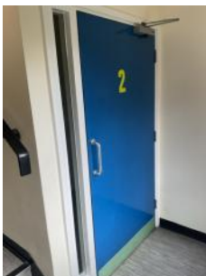
Version 4. Flat lobby entrance door.

Provide “fire doors keep shut” notice’s to all flat entrance lobby doors.