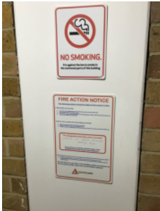
The provided fire action notice