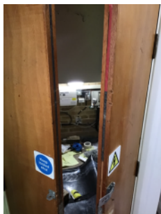
Missing strips and seal