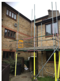
Construction of external walls