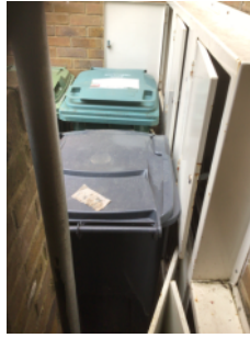
Consider installing a barrier to separate bins from the gas meters.