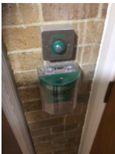
Electromagnetic door release with emergency override