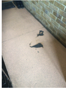
It is evident that a small fire has occurred on the 2nd floor landing.