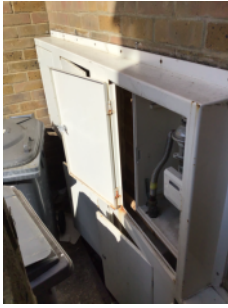
Unlocked gas meter cupboards