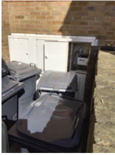
External bin store