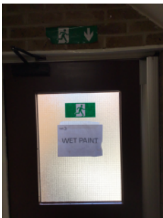
Escape route signage