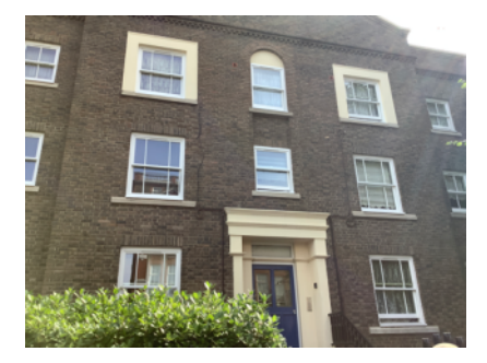
External walls - front elevation

Attention is drawn to the Ministry of Housing, Communities & Local Government Consolidated Advice Note for building owners of multi-storey, multi-occupied residential buildings, dated January 2020. The Advice Note recommends that building owners should consider the risk of external fire spread as part of the fire risk assessment for multi-occupied residential buildings. Consideration has been given to this matter within this fire risk assessment. The Advice Note further recommends the assessment of the fire risks of any external wall system, irrespective of the height of the building.