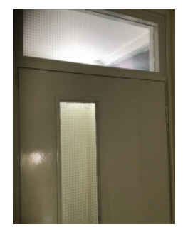
Georgian wired glazing

Are escape routes protected with suitable walls and floors? Yes Is there adequate compartmentation? Minor Defects Is there reasonable limitation of linings that might promote fire spread? Yes Glazing which is expected to be fire resisting, inc vision panels and fanlights: Flats Lobbies Staircases Flats Glazing · Georgian wired Lobby Glazing · Georgian wired Staircase Glazing · Georgian wired Is glazing reasonable and free from any obvious defects? Yes