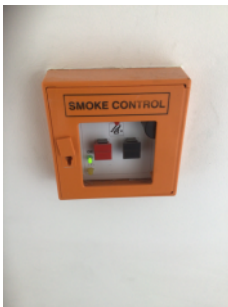
Manual smoke control device.

A BS5839-1 Category L3 smoke detection system is provided for the purpose of the actuation of the window AOV. Manual smoke control devices are also provided for fire service use