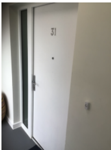
Example of flat entrance door.

It is understood that communal doors are inspected regularly by neighbourhood officers and formally recorded in the quarterly/6 monthly estate inspections with residents. Records are held with the neighbourhood officers. Flat entrance doors are inspected during the annual LGSR visits where the gas engineers record on their PDA if a door closer exists and intumescent strips and cold smoke seals exist.