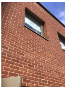
External walls rear elevation