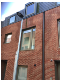
Brick/mortar construction, with tiled facade on second floor

There are rear exits to small gardens, however these do not provide a route to ultimate safety.