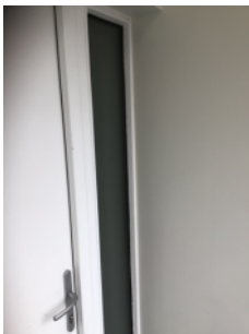
Glazed panels on flat entrance doors.

There are glazed panels to the side of flat entrance doors. These are showing no acid itching to confirm whether this glazing is fire resisting. This should be confirmed.