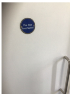
“Fire door keep locked” signage on riser cupboard doors