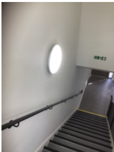
Maintained EL provided in common escape routes.

Although this inspection took place during daylight hours, given the provision of street lighting in the immediate vicinity and lighting provided by surrounding buildings, it is reasonable to assume there would be sufficient borrowed light to aid escape in these areas.