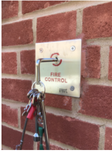
Fire service override device tested and working correctly